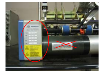
For new style S/N label By Nr = S/N